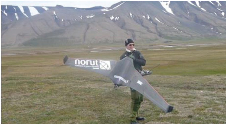
Figure 2: A fixed wing UAS used to measure NDVI over high arctic vegetation communities.

NDVI camera as for the S230 NDVI camera in order to avoid differences in measurements and to facilitate post processing. The community level measurements were taken 1.5 m above the surface, while measurements of the species level were taken 0.5 m above the surface.