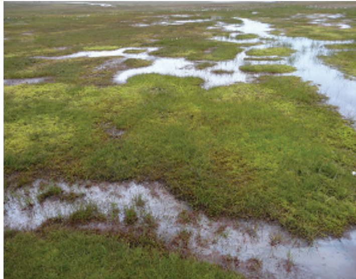
Figure 4: Fen with yellow-brownish coloured bryophytes (mainly Aulacomium turgidum ) and the graminoids Tundra grass ( Duportia fisheri ) and Arctic Cotton grass ( Eriophorum scheuchzeri ). This plant community was better separated in the RGB image than in the NDVI image.

sub-community levels within or between plant communities and vegetation types (e.g. the wet moss tundra and mires dominated by the mosses Aulacomium turgidum and Tomentypnum nitens and the sedges Carex saxatilis , Eriophorum triste and Eriophorum scheuchzeri ). The latter is also a challenge in the Landsat-based study of the study area (2).